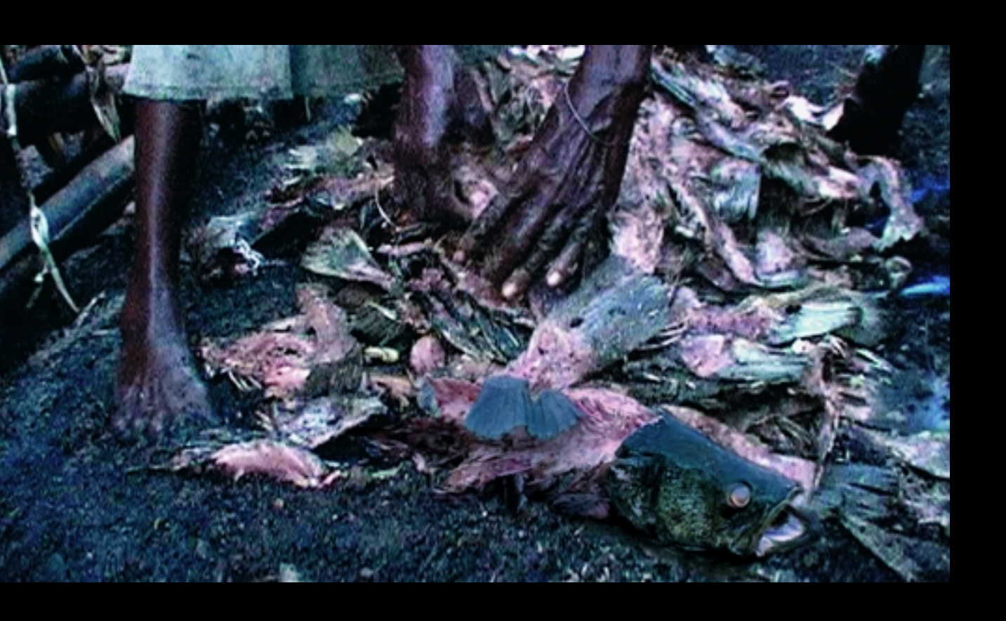
"It was easy to find striking images, because I was filming a striking reality. But it was also easy to get into trouble."